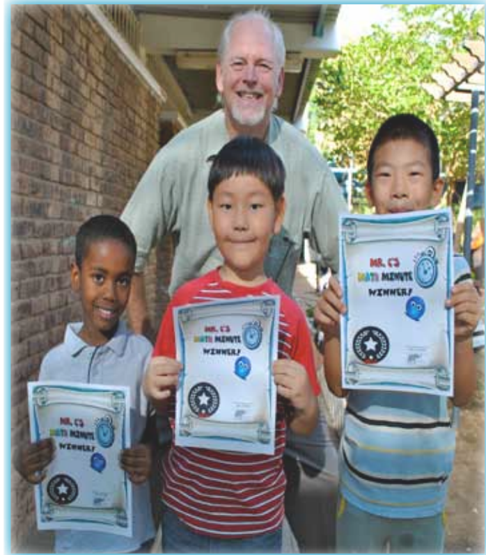
Last week's WINNERS!